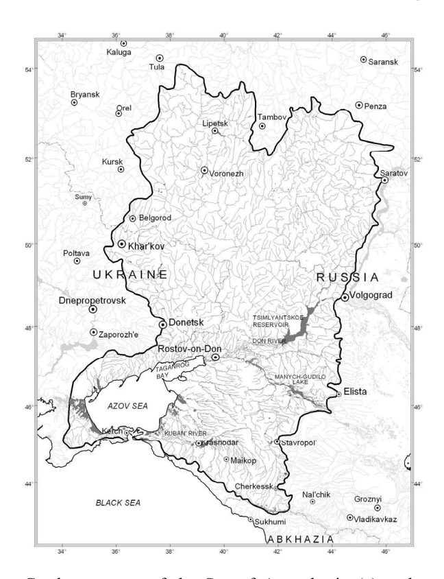
Figure 1: Catchment area of the Sea of Azov basin (a) and water system Taganrog bay Lower- Don (b).

As for the area the Don River basin exceeds that of the Kuban River by more than 7 times: 422 and 58 thousand km<sup>2</sup>, correspondingly. Qualitative differences between them are not less important. The River Don Basin is located inside the boundaries of the forest–steppe and steppe zones of the Eastern- European plain, changes of the run-off module over the basin area are relatively insignificant. The Kuban River basin is located in the northern slope of the Great Caucasus where the major part of this river run-off module. For the mountain areas a high variability of meteorological conditions leading to the instability of water regime is typical. On the contrary, the Don River basin in natural state is distinguished by the predictability of hydrological conditions. Variability of run-off is conditioned by mainly seasonal components: vernal flood and summer low water which in the southern part of the basin leads to the complete dry of small rivers.